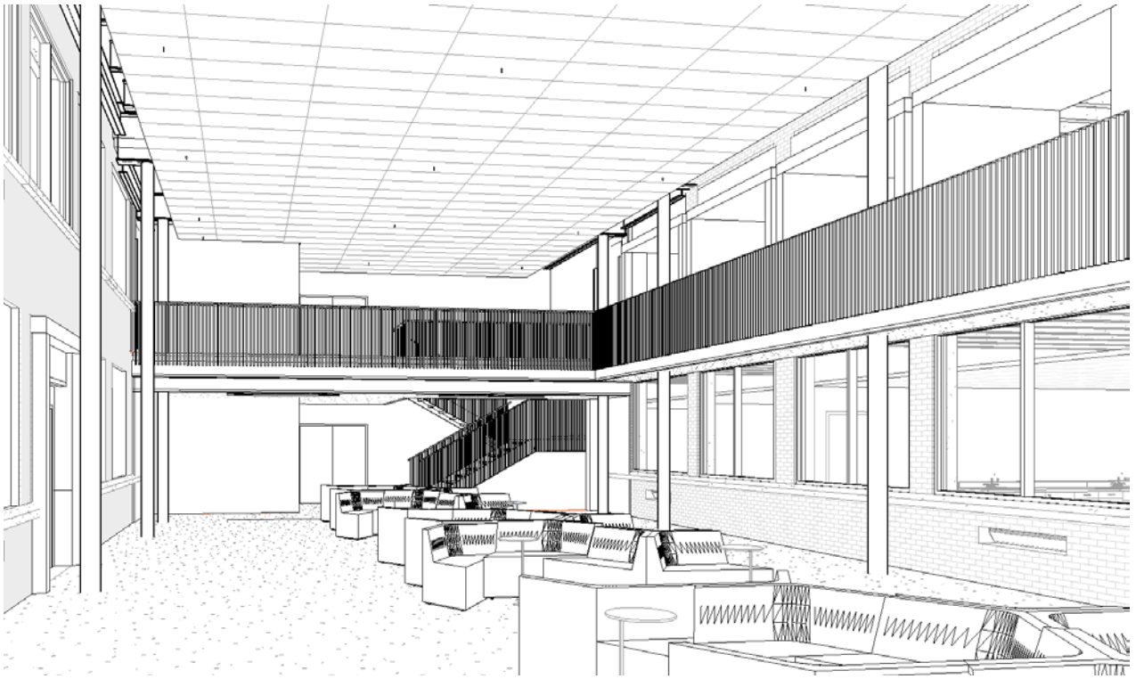
Interior view of new atrium looking north – not to scale

The existing brick will be cleaned and visible within the new space. New interior columns will support the roof structure.