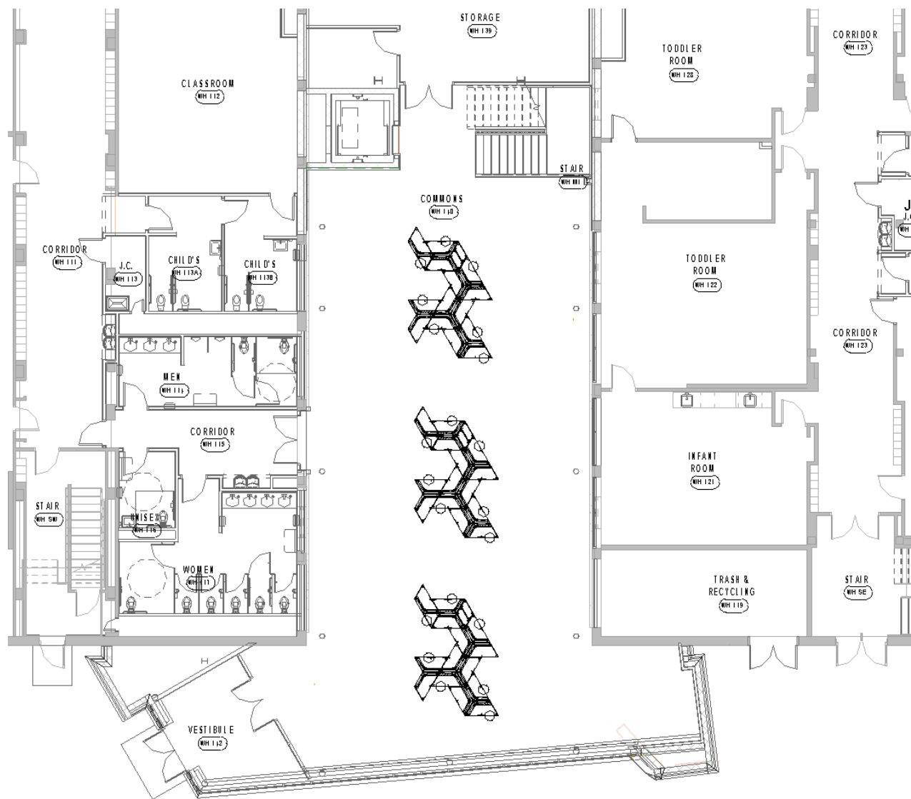
Partial First Floor Plan – not to scale

The atrium will be 21' feet in clear height. This atrium has classrooms which are part of a Child Care Center on the east side that are visible through windows. Children are a focus of the college, both through its departments, such as Early Childhood Education, as well as in the Child Care Center. The building houses academic departments, outreach centers, and a full range of classroom types. The stair will have terrazzo steps that will need to be coordinated with the overall artistic design.