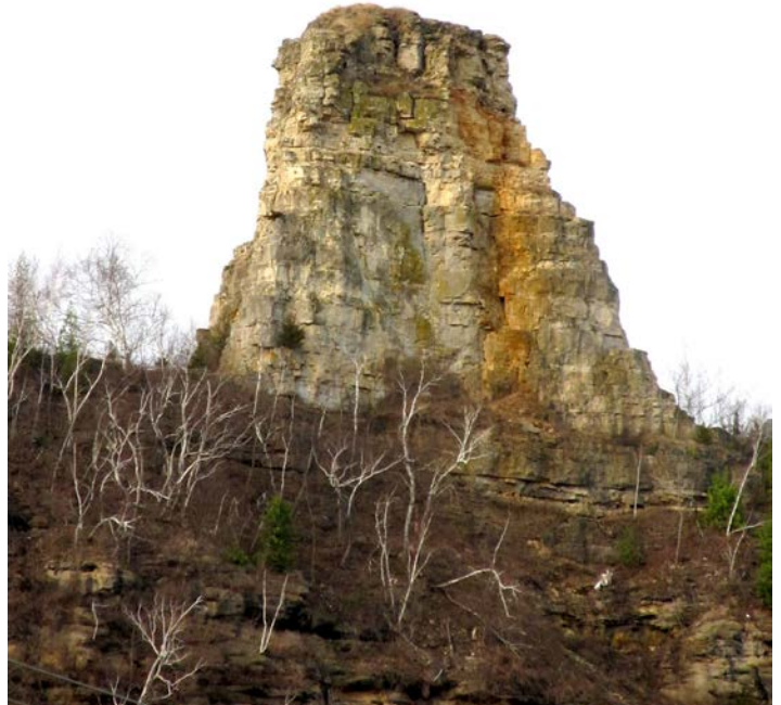
Natural stone bluffs

On a day-to-day basis, the space will be akin to an indoor plaza, and a point of intersection of all students in the College of Education. The new atrium will be the entry point for people accessing the upper floors, as well as an opportune place for chance interactions and cross-pollination among students and faculty from the various departments within the college. In this mode, the space is partly about efficient movement of people, and partly a touch-down point, where someone can grab a seat for a few minutes. On an occasional basis, the space will be used for large gatherings. In these events, there could be a reception with large round tables; in other cases, there will be lecture, with rows of chairs facing a presenter located at the north end of the room.