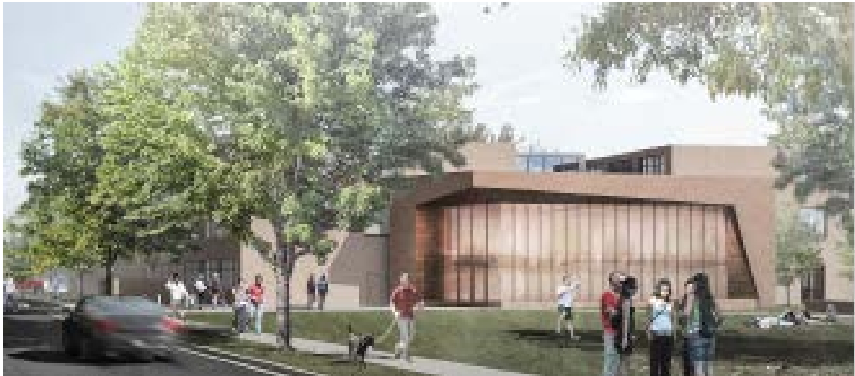
Partial exterior view of new entry and existing building

The existing brick will be cleaned and visible within the new space. New interior columns will support the roof structure.